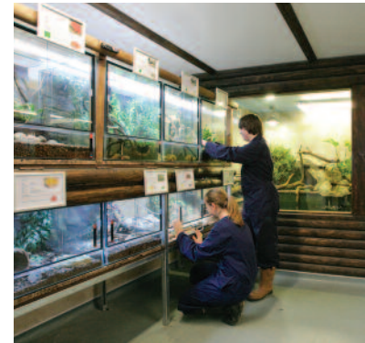
Students tend to some of our underwater animals

But there is still work to do – our next focus is to look at improving the Farm, Animal Care Centre, Countryside and Fisheries facilities to provide our students with the best possible experience and opportunity for success. So watch this space – I hope to bring yet more news of success at Shuttleworth next time!